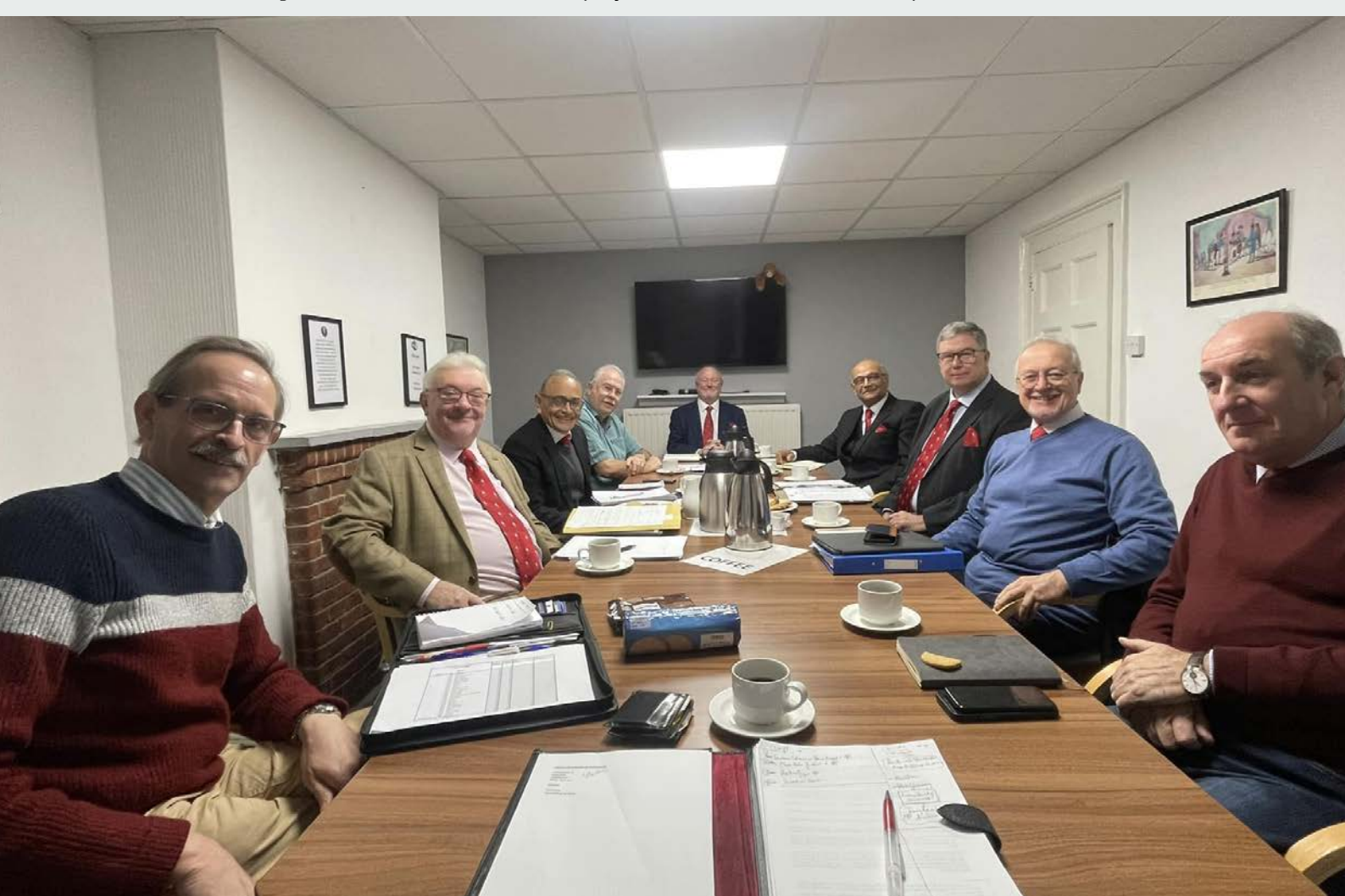
Regular monthly meeting of the Royal Arch Executive - 1st December 2023. As the Craft and Royal Arch operate as one aligned organisation in West Kent, our Deputy Provincial Grand Master is a permanent invitee.

May I take this opportunity to wish you, your families, and loved ones – especially those who will be alone – a very merry Christmas and a healthy, happy and peaceful New Year. God Bless you all.