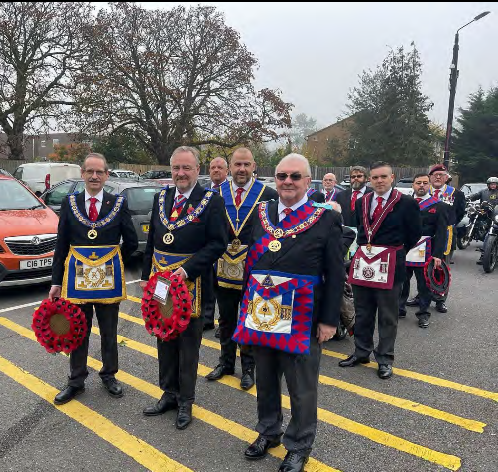
Sidcup Remembrance Parade