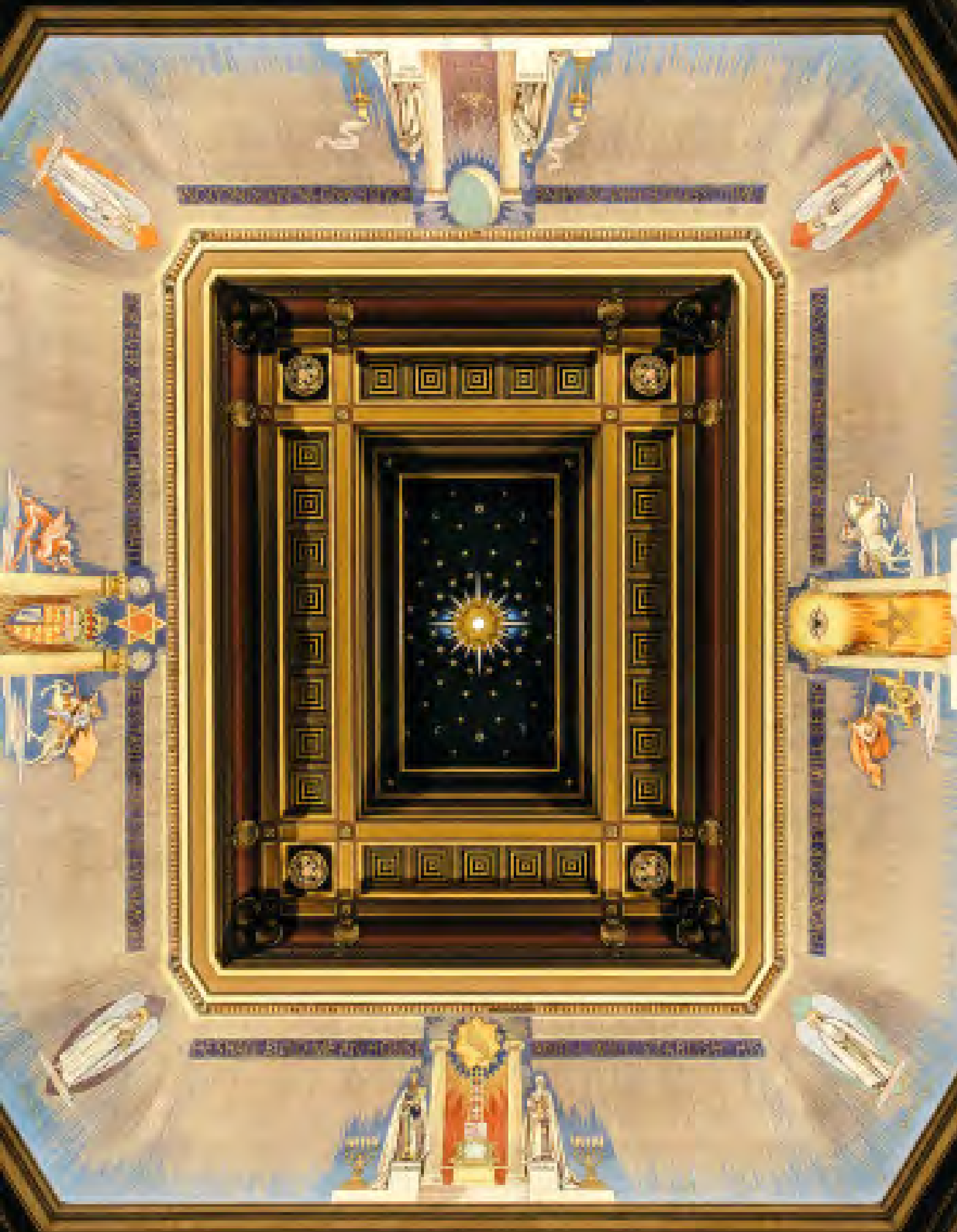
Grand Temple, Freemasons Hall, Great Queen Street